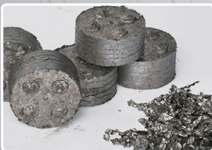
碳鋼 Carbon steel